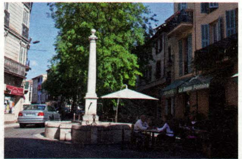
The Basse Fontaine