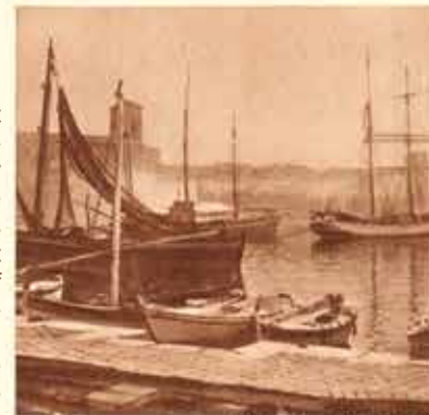
Cliché S. I de la Ciotat

At the end of a bay, La Ciotat, a town with a larger population than Cassis, is separated from it by the Bec de l'Aigle promontory. This is another port, equally attractive in appearance. There are three hotels and apartments for rent. Its beach is vast; it stretches out of town, in front of a Casino. In the immediate vicinity, the calanques of Muguel and Figuerolles have beaches where one can also swim. – T.O. at the Town Hall.