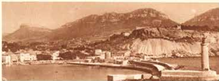
Cliché Essi Cassis

You can get there from Marseille in less than an hour by train and by P. L.M. coaches. It is a small port, at the foot of Mont Canaille. You can swim there on a beach dominated by pine woods. Its five hotels are very busy. In the surroundings, one can visit the calanques of Arène, En-Vau, Port-Pin, Morgiou and Sormiou. – T.O. near the Port.